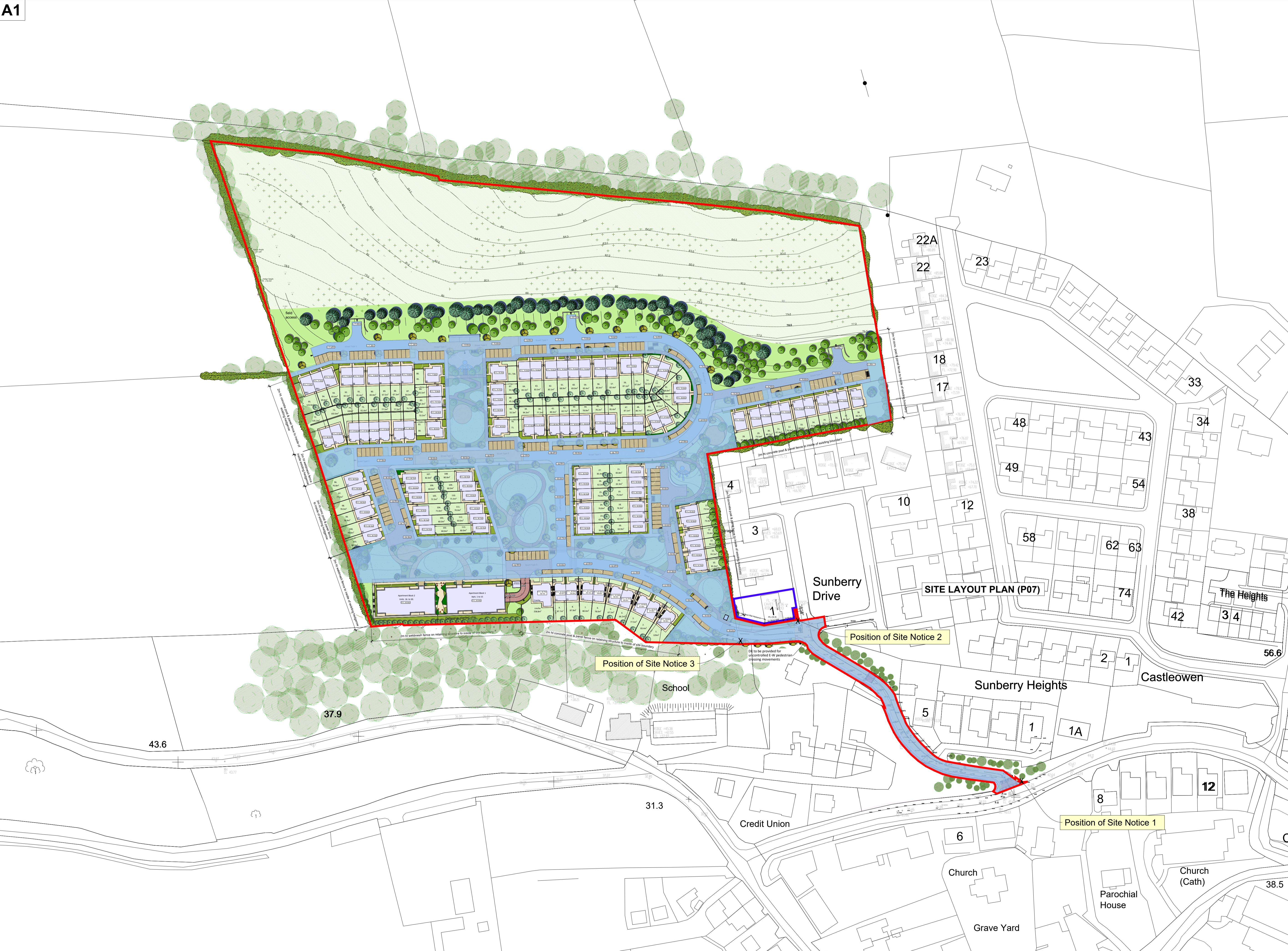
SITE LAYOUT PLAN (P07)

Notes: All Inspection Chambers and Service connection pipework to comply with Irish Water Standard Details Drawing No.'s : STD-WW-01 to STD-WW-04 Foul pipework taken over/taken in charge by Irish Water will meet EN13476 (SN8)